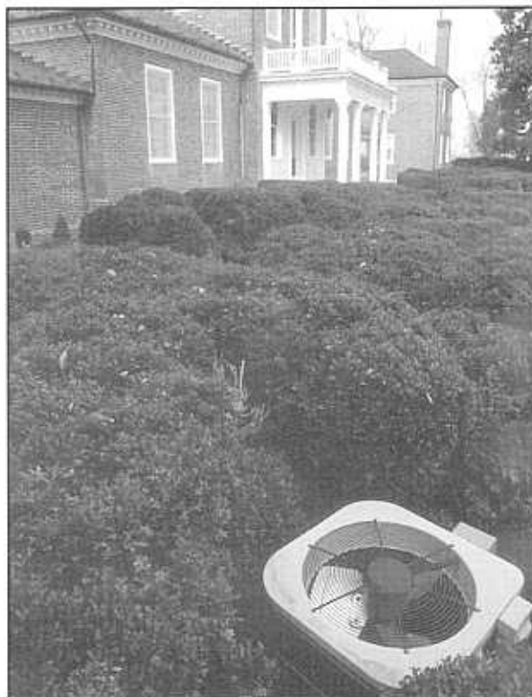
Condensing units were cleverly hidden in the Old English Boxwoods surrounding the Plantation.

Extreme cold, oppressive humidity, an expansive structure. Add to these challenges the historic value of the Plantation, how it was built, its ornately decorated interi-