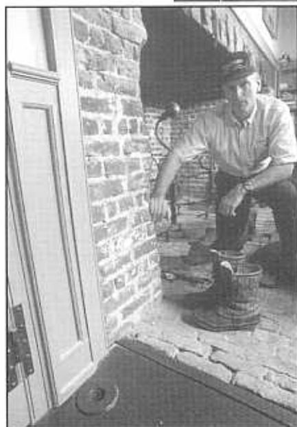
Above: Unico System air handling equipment fits conveniently above storage cabinets in the pantry.