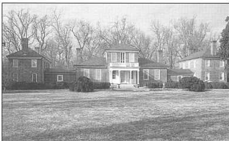
The historic Brandon Plantation in Spring Grove, VA.

S prawling across the banks of the James River, just beyond the stone walls that bear the dents of cannonball fire from the Civil War, you'll find the majestic Brandon Plantation of Spring Grove, Virginia. The home is truly a treasure-box full of history: a clock once owned by Marie Antoinette, a collection of Early-American and Chinese antiques, original woodwork and architecture dating back to the 1700s, an addition believed to be designed by Thomas Jefferson in 1765. The list of finds is long, and