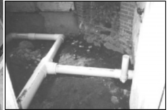
Using PVC, the lines for the Unico AC were constructed and buried 18" below grade.

plumbing and electric. Four inches of radiant concrete slab was poured, and radiant floor tubing and extruded aluminum heat transfer plates were installed on top of the slab. The refinished original wide-planks were then re-installed to finish off the flooring and the Unico System's five-inch round air outlets were placed unobtrusively in the flooring to preserve the aesthetics.