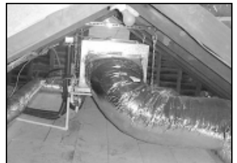
With no attic, space was limited so the Unico System's flexibility was key to the project.

Young installed two systems, one for each floor of the farmhouse. Two Unico High Velocity Air Handlers were installed along with two American Standard Allegiance Condensing Units. For the lower floor, the air system was designed by using schedule 40 PVC installed 18" below grade, along with the radiant floor manifold piping,