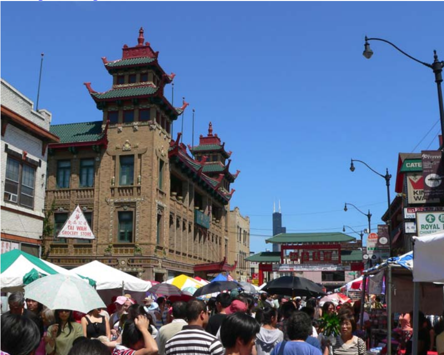
On Leong during summer festival, 2007, Darius Bryjka