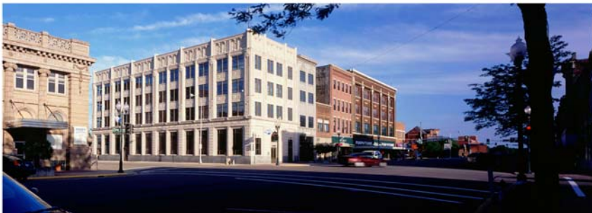
Downtown Expo, Freeborn Bank Building, Albert Lea, MN