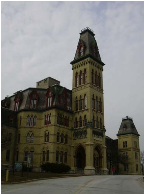
Milwaukee Soldiers Home

The Milwaukee Soldiers Home Historic District is one of the 3 original National Soldiers Homes authorized by President Lincoln in 1865. The site occupies approximately 90 acres and includes 25 buildings, among which are excellent examples of Greek Revival, Queen Anne and Gothic Revival architectural styles. Additionally, the site is listed on the National Register for its significant archeological resources, as the location of a 400 million year old underwater reef. The site faces an urgent threat because of the ongoing deterioration of the buildings which have stood unused for decades. In addition, work proposed through the Veterans Administration Enhanced Use Lease Program could open 37 acres of vacant land and six historic buildings to commercial development. The MWO's challenge in FY08 will be to help all of the involved parties find a restoration/redevelopment plan that satisfies both the needs of the existing Veterans Administration Hospital for redevelopment and the concerns of numerous veterans' groups who want the site to continue to respect the legacy of this country's veterans.