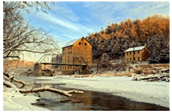
Motor Mill Cooperage, Elkader, IA, www.motormill.org

Fund awarded grants to the City of Albert Lea for a Downtown Expo which will encourage appropriate renovation of historic buildings; and to Historic St. Paul to support the survey of housing stock in Invest St. Paul areas, to identify structures with historic or architectural character presenting opportunities for rehabilitation. The Landes Fund awarded its first grant to the Clayton County Conservation Board for an assessment of the Motor Mill Inn and Stable in Elkader, including documentation of current conditions and recommended repairs.