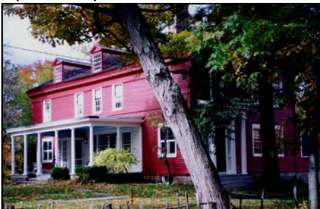
Weir Farm National Historic Site, Wilton, CT.

The National Trust has awarded nearly $65,000 in planning and implementation grants to 14 sites across the country participating in its Historic Artists' Homes and Studios program, an initiative funded by the Henry Luce Foundation.