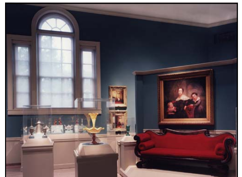
The Portland (ME) Museum of Art's Lorenzo di Medici Sweat Galleries, winner of a 2003 Honor Award.

Each year, the awards recognize the efforts of individuals and organizations who have given new meaning to their communities through preservation, including attempts to save and maintain important landmarks, companies and craftsmen whose work restores the richness of the past, public officials who support preservation legislation in their communities, and educators who help Americans understand the value of preservation. A nomination form is available on-line.