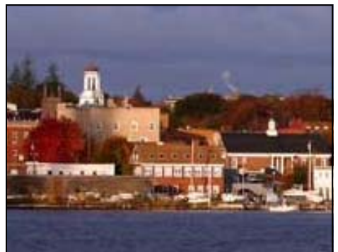
The Waterfront in Bath, Maine.

Bath, ME , on the banks of the Kennebec River, is an old seafaring town whose maritime history dates from the launching in 1607 of the first ship built in the New World by English settlers. Bath's tree-lined avenues are an outdoor gallery of humble and grand examples of classic American architecture.