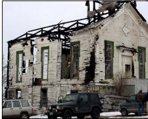
The Grange, days after a devastating fire.