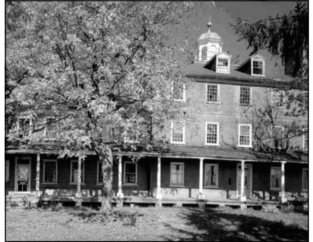
The river-front elevation of the Lazaretto.