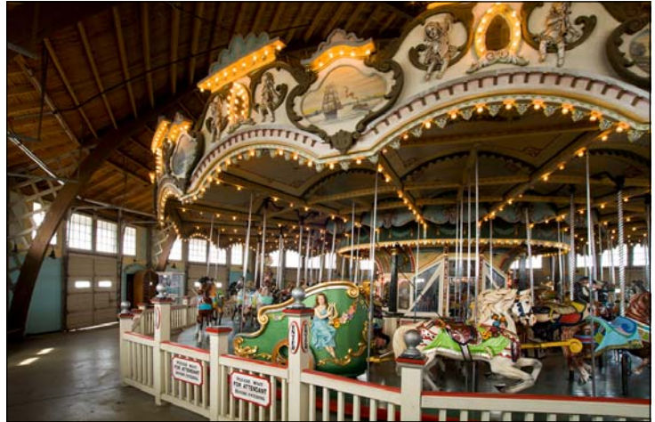
Paragon Carousel

Announced on May 18, the public vote winner is...the Paragon Carousel in Hull! Garnering 15% of all votes submitted, they will receive a $100,000 Partners in Preservation grant. This money will go toward installing historically accurate doors and restoring the original windows of the 12-sided building that houses the carousel — one of only three such buildings in the U.S. still housing its original carousel. This win is a huge achievement for a small grassroots organization that leveraged all resources available to them, including technical preservation assistance from the Massachusetts Circuit Rider program, a partnership of Preservation Massachusetts and the Northeast Office.