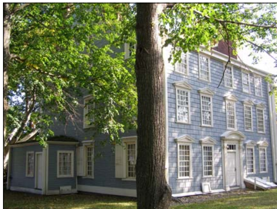
The Royall House and Slave Quarters in Medford, MA is a National Historic Landmark built in 1732. The National Trust's Northeast Office and The 1772 Foundation consulted together on construction and funding needs of the organization.

In this economic climate, as many sites understand, it is difficult to secure funding to restore, preserve, and promote the rich African American architectural history in the north. The Northeast Office is exceptionally pleased to work in partnership with The 1772 Foundation to support those working to preserve places of importance in African American history. We thank The 1772 Foundation for its generosity and vision for advancing African American preservation.