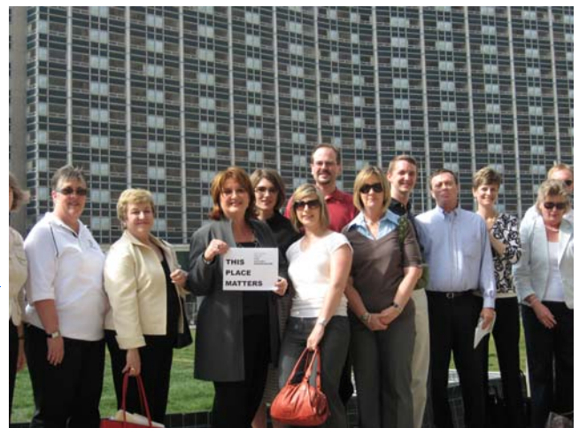
Dallas Statler Hilton "11 Most Endangered" in 2008

Since 1988, the National Trust for Historic Preservation has used its list of America's 11 Most Endangered Historic Places as a powerful alarm to raise awareness of the serious threats facing the nation's great treasures. It has become one of the most effective tools in the fight to save the country's irreplaceable architectural, cultural, and natural heritage. The list, which has identified 200 sites through 2008, has been so successful in galvanizing preservation efforts across the country and rallying resources to save one-of-kind landmarks that in just two decades, only six sites have been lost.