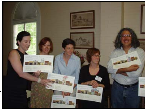
PLT Participants from San Antonio 2005

For more information call 202.588.6067, e-mail plt@nthp.org , or visit http://www.nationaltrust.org/plt .