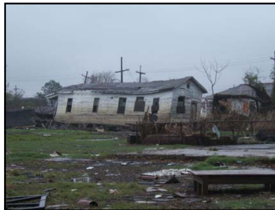
Lower 9th Ward