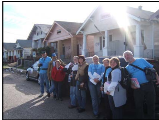
New Marigny Assessment Team

No matter what the situation of any of the people in New Orleans, rich or poor, black or white, this is a story about human loss and their "home." Think of what would happen if this was you, think of what you can do to help. No matter alive or gasping for air, I still love New Orleans.