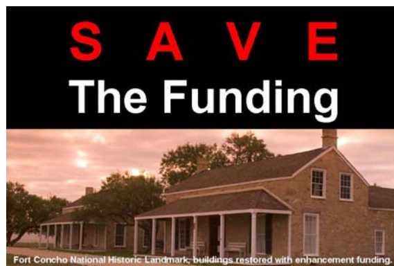
Fort Concho National Historic Landmark, buildings restored with enhancement funding.

The risk of losing this source of funding is too great to sit idly by, and the National Trust is working with our statewide