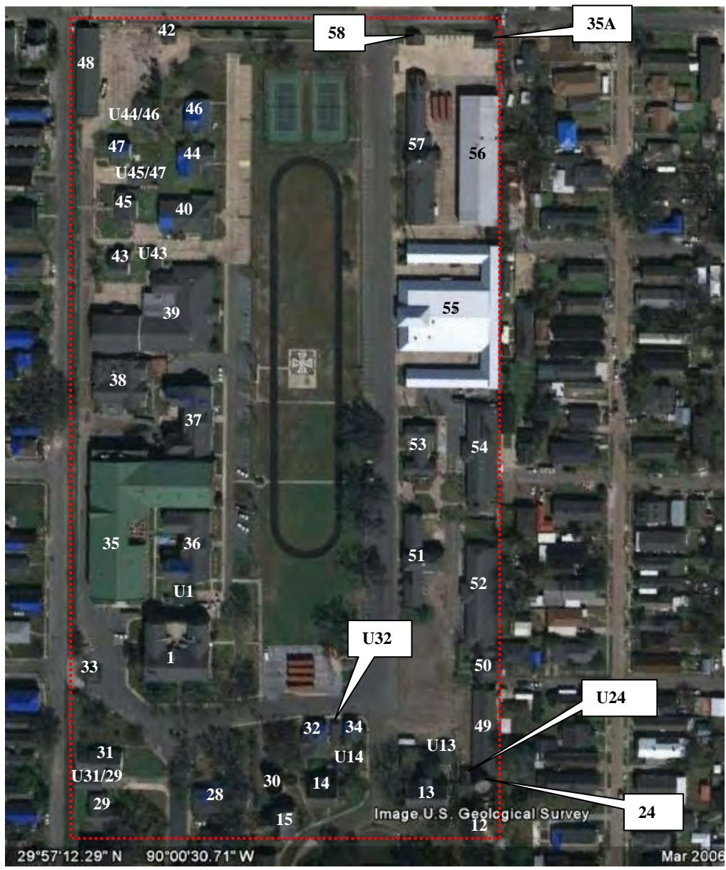
Attachment 1. Aerial photograph showing the Standing Structures Area of Potential Effects (APE) (outlined in red) within Jackson Barracks.