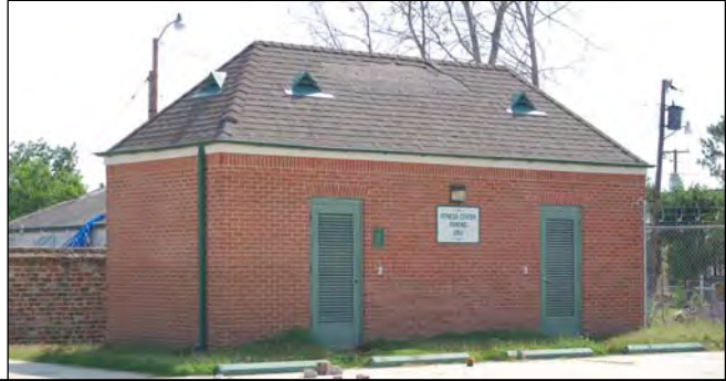
Building 35a (Not Contributing to NRHD)