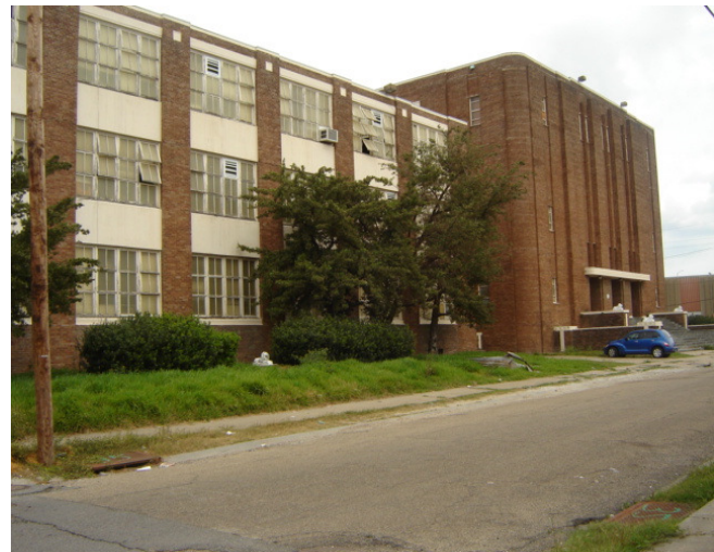
Booker T. Washington High School. 2005.

The Recovery School District is requesting that FEMA provide funds to rehabilitate the existing auditorium and the auditorium's entrance/lobby, and to demolish the remainder of the buildings, sidewalks and parking areas at the campus of Booker T. Washington High School, Orleans Parish, LA. The regulations at 36 CFR Part 800 require, as the funding agency, to identify if any of the properties proposed for demolition and rehabilitation are listed in or eligible for listing in the National Register of Historic Places; to assess the effects the demolition and rehabilitation will have on historic properties; and to seek ways to avoid, minimize, or mitigate any adverse effects.