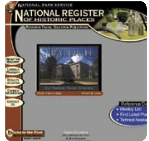
National Registration Homepage.

We invite you to visit the National Register’s website at cr.nps.gov/nr , where lists and other information on registered historic places and how to become involved in protecting historic places in your community can be found. By searching the historic preservation theme index of the National Register’s Teaching with Historic Places lesson plan series, teachers can quickly access lesson plans with activities for students such as identifying and evaluating