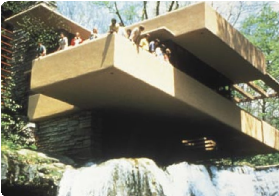
Frank Lloyd Wright's Fallingwater, Pennsylvania.

The National Register criteria for evaluation are designed to recognize historic places that reflect the contributions of all our people to the country's history and heritage. The quality of significance in American history, architecture, archaeology, engineering, and culture is present in districts, sites, buildings, structures, and objects that retain their essential historic character and that meet one or more of the four specific criteria. To be eligible for listing, a historic place may represent important historical trends and events; reflect the lives of significant persons; illustrate distinctive architectural, engineering, and artistic design achievement; or impart information about America's past.