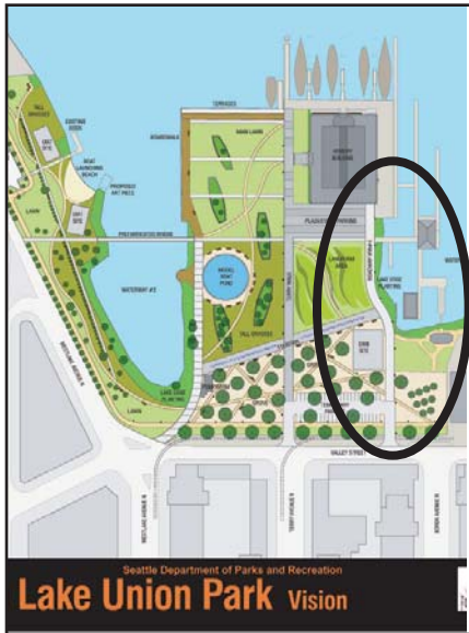
Seattle's plan for Lake Union Park includes expanded CWB facilities and access.