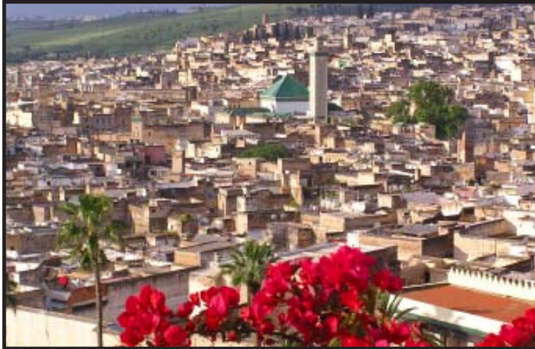
The Medina (old city) of Fes

craft making still passed on in ageless ways from master to disciple. Lunch at a converted residence in the heart of the medina. A driving tour of the ramparts and a visit to a pottery and tile factory concludes our day.