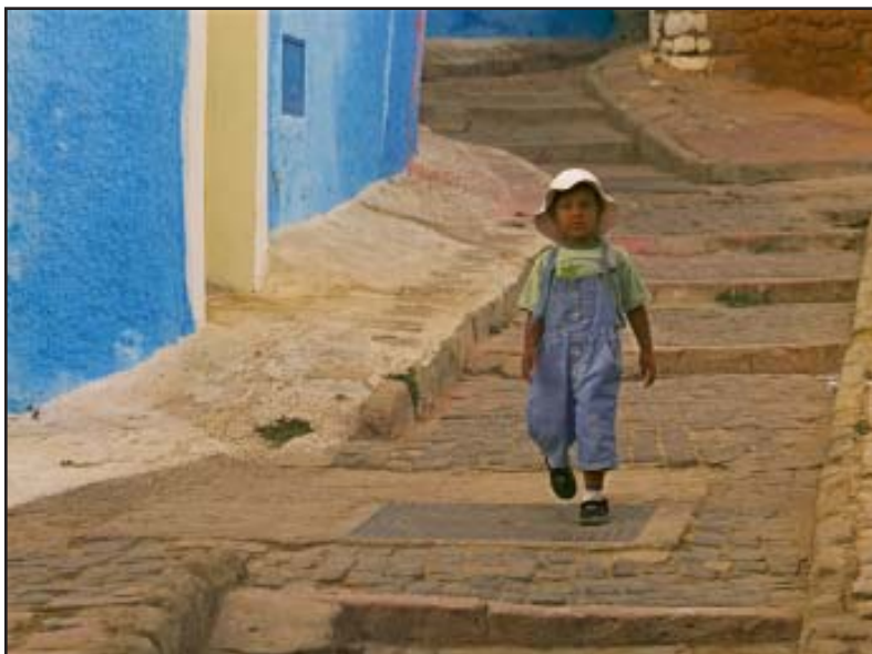
Oudaïa casbah, Rabat

Tangier is one of the land's oldest cities, for ages the focus of power struggles between Europe and North Africa. We begin with a walking tour through the old town